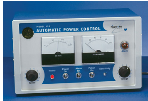
Model 120 Automatic Power Control

At any time during an alarm condition, the audible alarm can be silenced. The alarm indication light remains illuminated.