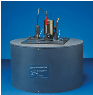
Model 220 Low Temp Container for low temperature polishing.

Manufactured entirely from electrolyte resistant materials.