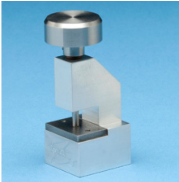
Model 130 Specimen Punch prepares high-quality disk specimens.