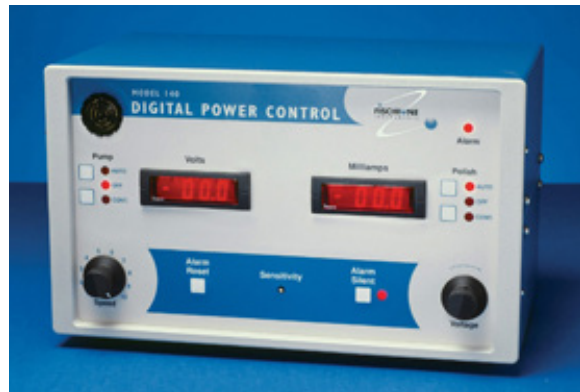
Model 140 Digital Power Control