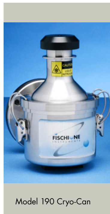
Model 190 Cryo-Can

All system components are easily accessible for service. The ion source is designed for both long component life and extended maintenance intervals. When needed, the filament can be readily replaced. Password-protected diagnostic software allows complete control over all instrument functions.